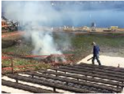
Clean-up at Hillside Chapel

Twenty men from Decatur Church of God Men's Ministry held a retreat April 7 & 8 on the YCL Campgrounds. They held learning/teaching/worship sessions in the worship area of the Administration Building, cooked and ate in the cafeteria, and spent several hours working on the grounds.