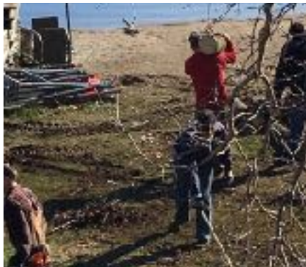
Clean-up at beach area

Work projects included the removal of at least 6 trees, raking and burning leaves, cleaning up sticks and debris, cleaning the rust stains in the bathrooms and living areas of Farlow and Riggle Dorms, smoothing driveways, removing some stumps and repairing some tombstones in the cemetery at the west edge of the campgrounds. Thanks to these men for investing in YCL!