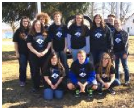
Staff & CITs

At our Senior High Fall Getaway in October of 2016, I asked the youth and Staff if they thought we could do a Polar Plunge at YCL. They said “Yes,” so we met in December to plan for an event in February. The Lord gave us wisdom as to how to reach out for donations and when to schedule the event. Letters asking for donations for the Youth Camps Program were sent to family and friends. A few churches were asked to announce the activity to their congregations.