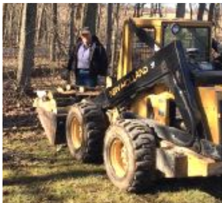
Needed equipment was brought