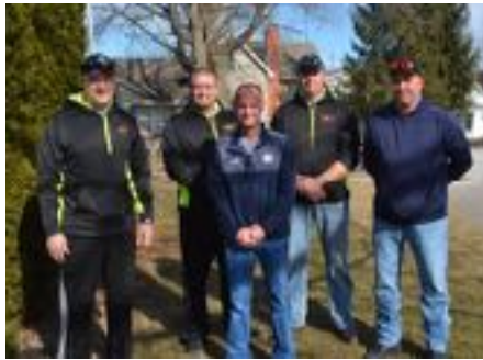
Members of Kosciusko County Sheriff's Dive Team